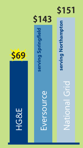
April 2022: Residential customer consuming 500 kwh/month. Amounts shown include all discounts and use the fixed default generation supply price.