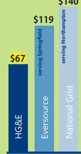
April 2020: Residential customer consuming 500 kwh/month. Amounts shown include all discounts and use the fixed default generation supply price.